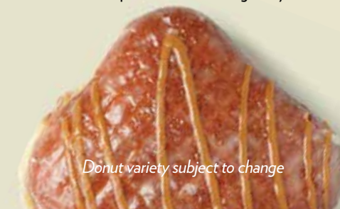
Donut variety subject to change