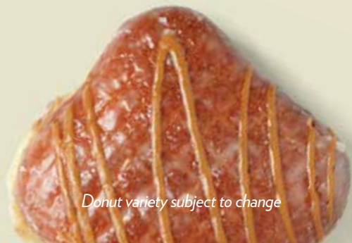
Donut variety subject to change